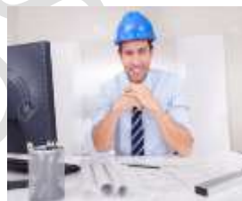
He is an engineer.