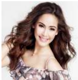
She is an actress.