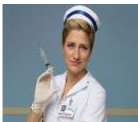
She is a nurse.