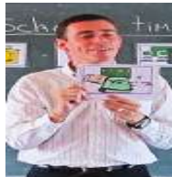
He is a teacher.